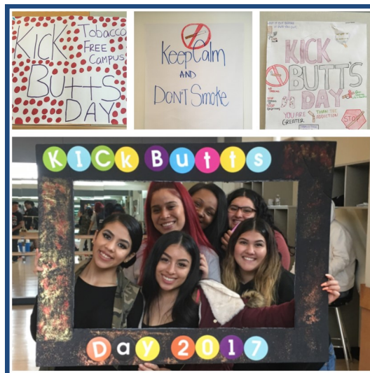
The SBHC's Youth Advisory Board members run a Kick Butt's Day event in March 2017.

The Sylvester Greenwood School-Based Health Center was founded during the 2015—16 school year as part of West Contra Costa Unified School District's Full Service Community School initiative. The health center supports students to meet the challenges in their lives and also works closely with faculty and administrators campus-wide to build a strong and positive culture to support school success for all students.